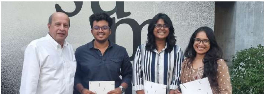
Wooden Web - Pavilion Seating