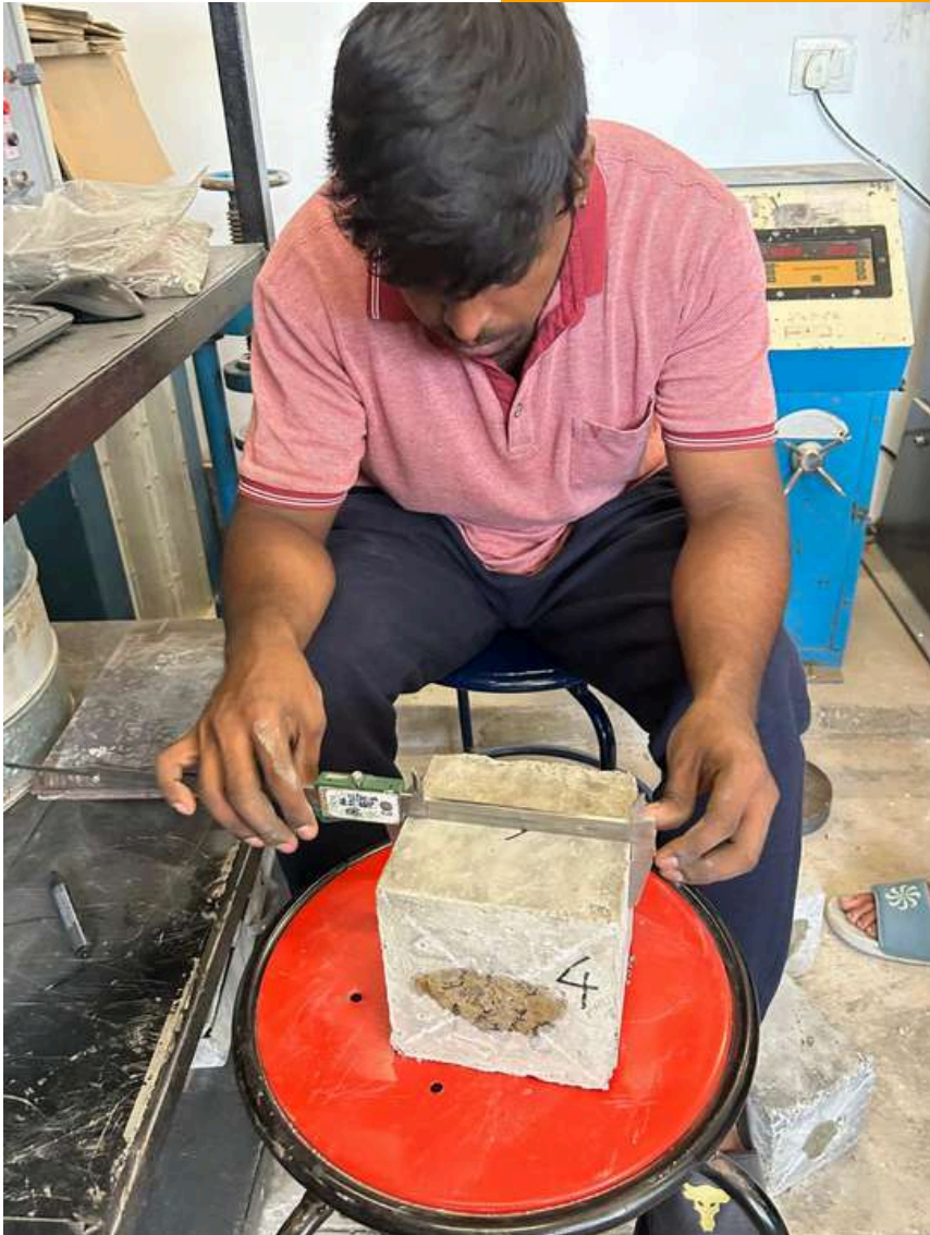
Structural Rehabilitation Experimental and Numerical Analysis Studio