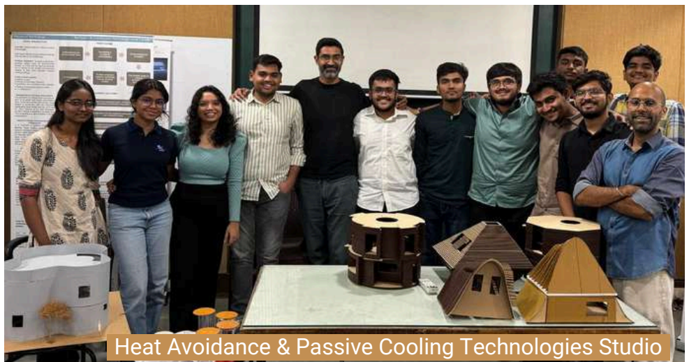
Heat Avoidance & Passive Cooling Technologies Studio