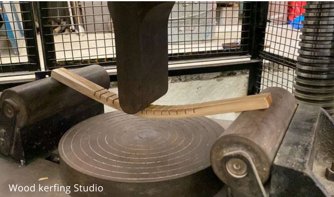
Wood kerfing Studio

Principal Architect | Vasav Bhatt Architects