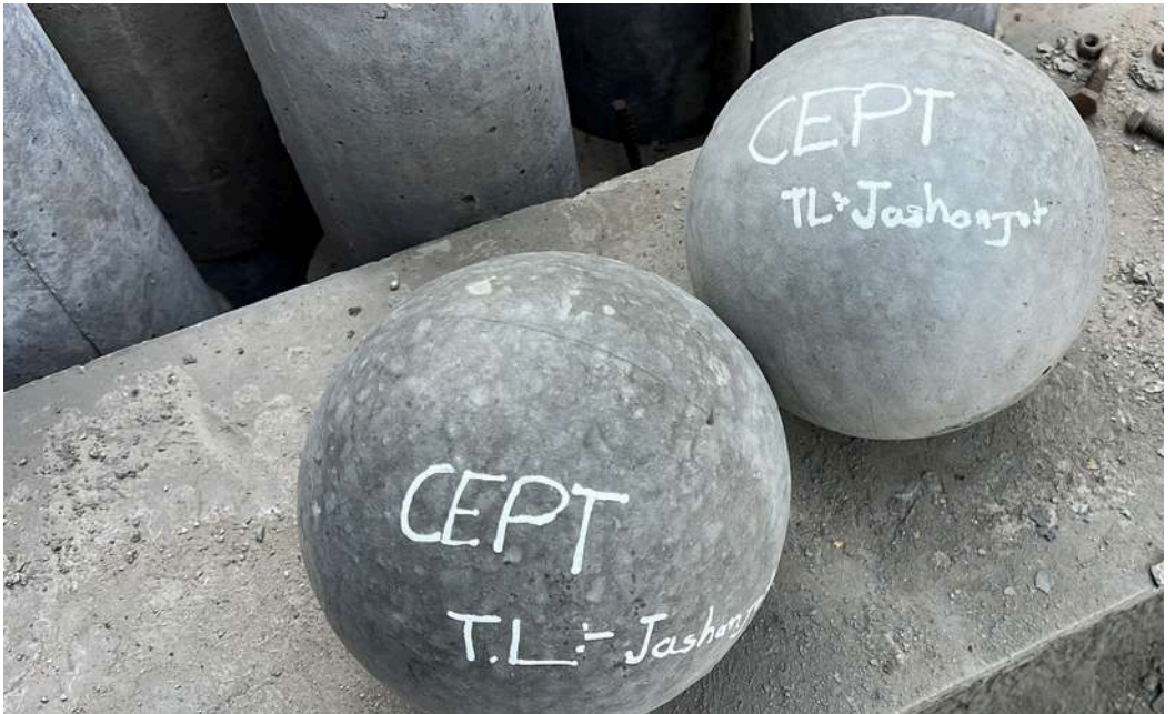
Second-year students secured first position in the 'Con-Bowling' competition in November 2024.