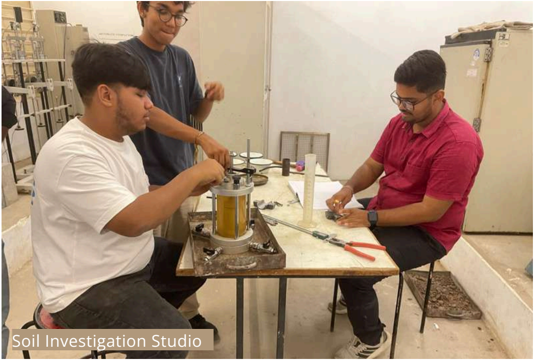
Soil Investigation Studio